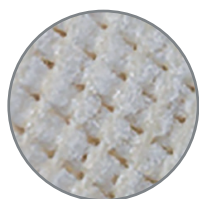
Jersey Textured CleanTube™