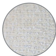
Lacoste Ribbed CleanTube™

The unique tubular shape of the wipe allows technicians to “load” their arms with several wipes at a time to diminish downtime, and the heat-sealed edges naturally roll outward to reduce the potential for particle contamination from cut fibers. Originally designed for removing excess sealant, these low-linting wipes are also excellent for cleaning paint automation equipment.